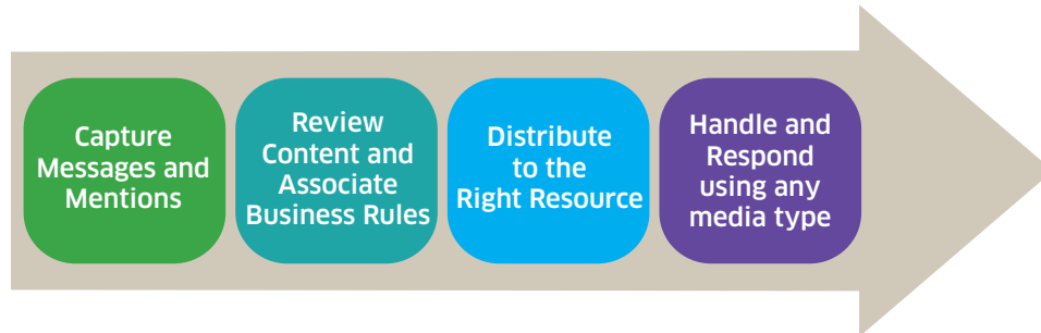
Figure 1: Genesys Social Engagement enables management of social media communication for one conversation with the customer

You can think of your social media strategy as four general steps, progressing from passive listening to active customer engagement and integration.